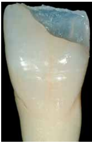
Figure 4: A lingual shell of semi-translucent enamel shade composite defines the outline of the final tooth.