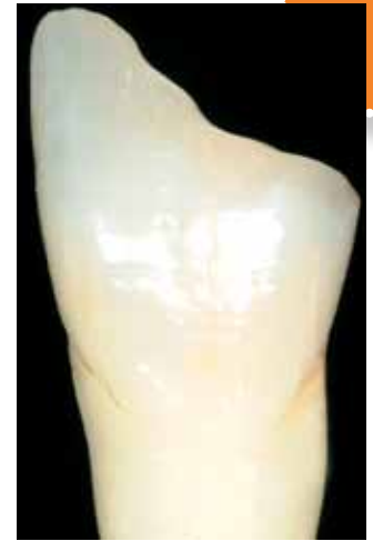
Figure 3: It is helpful to have two bevels to visually blend the cavo-surface into the surrounding tooth structure.