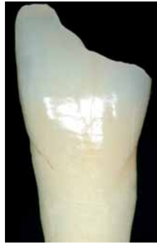
Figure 2: It is necessary to understand the components of the optical properties of the adjacent tooth structure.

A CLASS IV FRACTURE REQUIRES an understanding of the components of the optical properties of the adjacent tooth structure to create an invisible restoration (Fig 2). A series of two bevels is helpful in visually blending the cavo-surface into the surrounding tooth structure. The primary bevel involves the first 2 mm of the preparation. The secondary bevel continues from this point and tapers into the tooth's final facial contours (Fig 3).