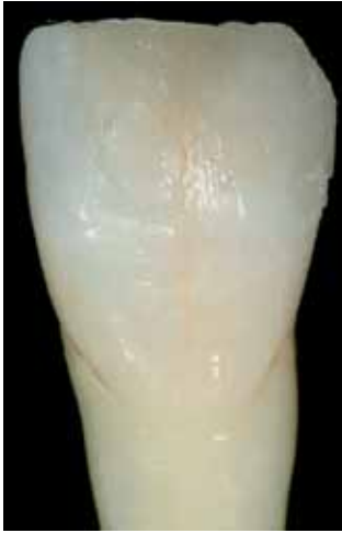
Figure 7: A final layer of enamel resin is applied.