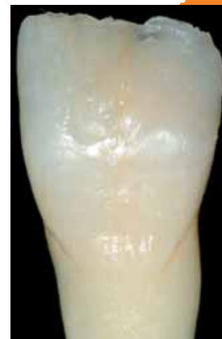
Figure 6: A chromatic or body shade resin is helpful in eliminating any visual recognition of the cavo-surface.

A CHROMATIC OR BODY SHADE RESIN is helpful in eliminating any visual recognition of the cavo-surface. This demarcation should disappear before the final translucent layer is applied. Also, if any maverick colors, fracture lines, or internal characterizations are to be applied, this must be accomplished during preparation of this layer (Fig 6).