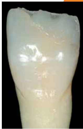
Figure 5: A dentin shade is sculpted.

A LINGUAL SHELL OF SEMI-TRANSLUCENT ENAMEL shade composite defines the outline of the restored tooth. This is best developed utilizing a lingual putty stent created preoperatively from a diagnostic wax-up, or a composite mock-up intraorally (Fig 4). A dentin shade (which typically has the highest opacity in most resin systems) is then sculpted to reproduce the natural contours of the dentinal lobes observed in the adjacent tooth structure or adjacent teeth (Fig 5).