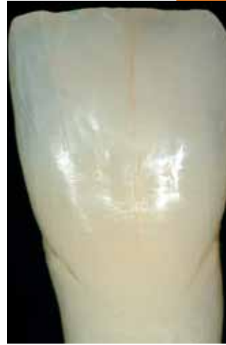
Figure 8: It is important to replicate the surface texture and polish that exist in the natural tooth surface.

A FINAL LAYER OF ENAMEL RESIN that mimics the translucency of the adjacent tooth structure is applied ( Fig 7 ). Once the general contours of the tooth have been created, it is important to replicate the same surface texture and polish in the restorative material as exist in the natural tooth surface ( Fig 8 ).